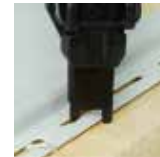
Vinyl siding att available FSM38V